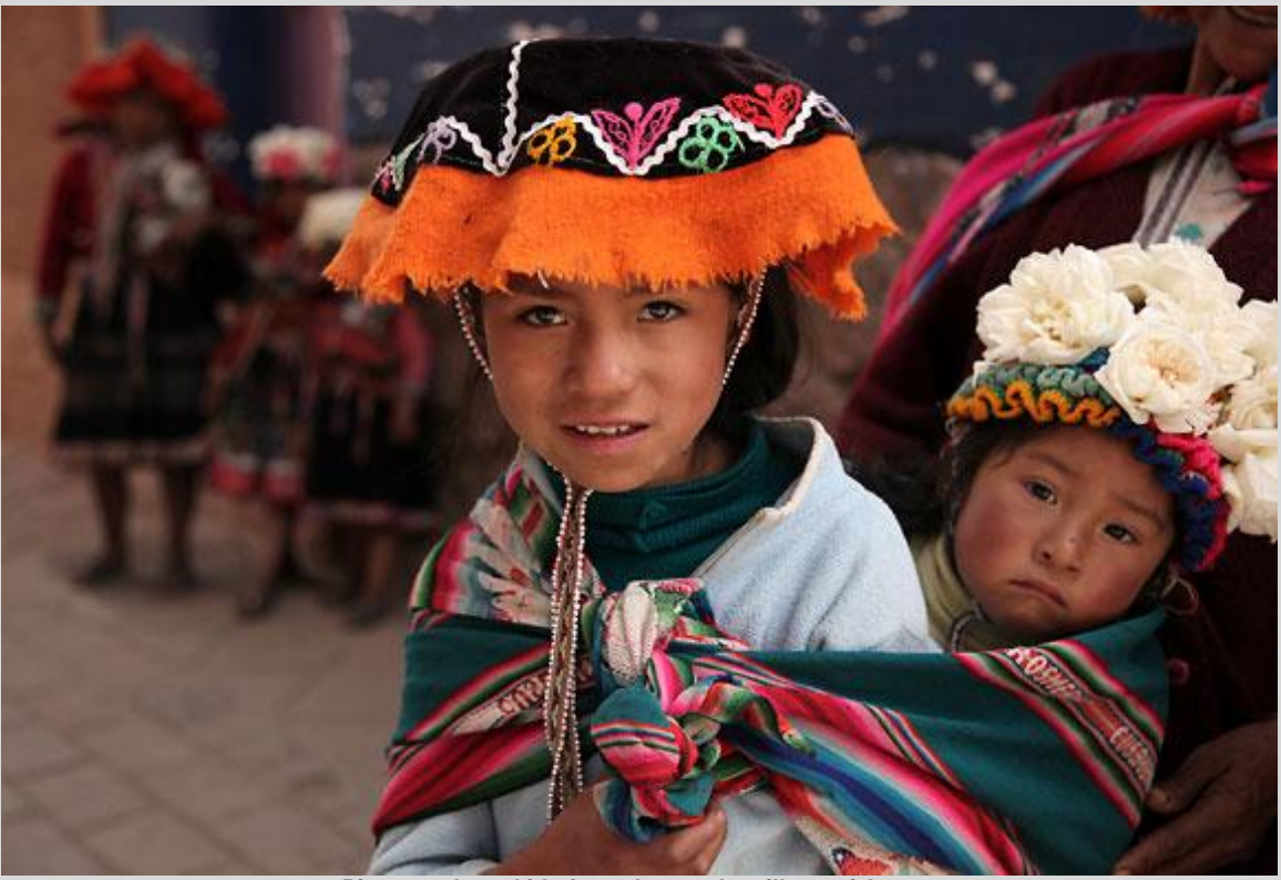
Pisac market - kids from the nearby village of Amaru